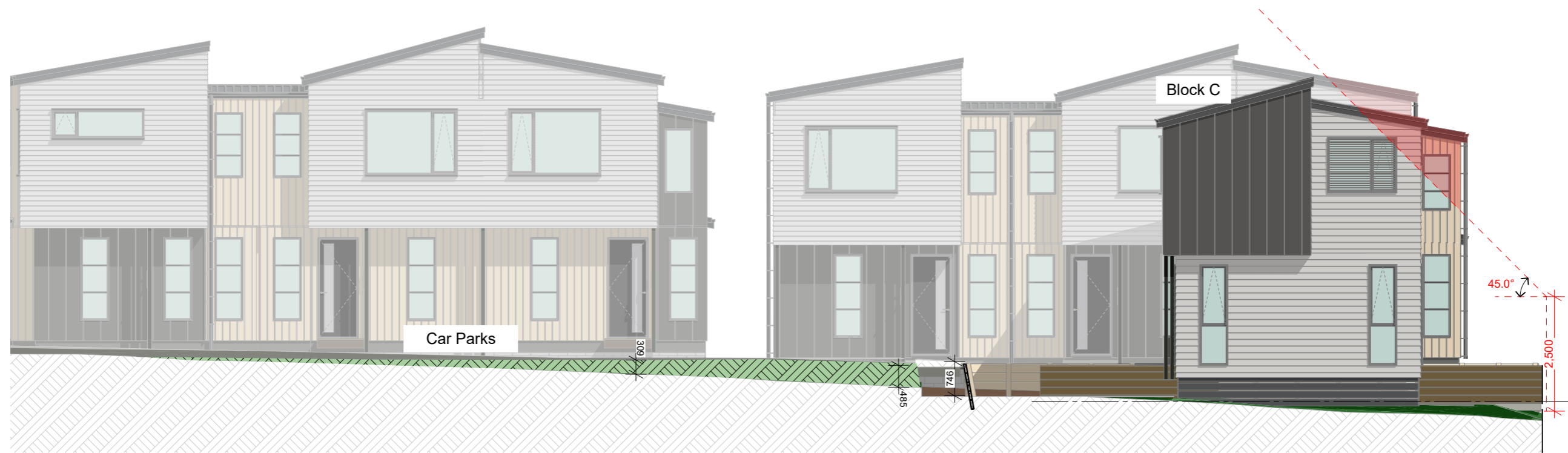
6 South Elevation Block C & D 1:100