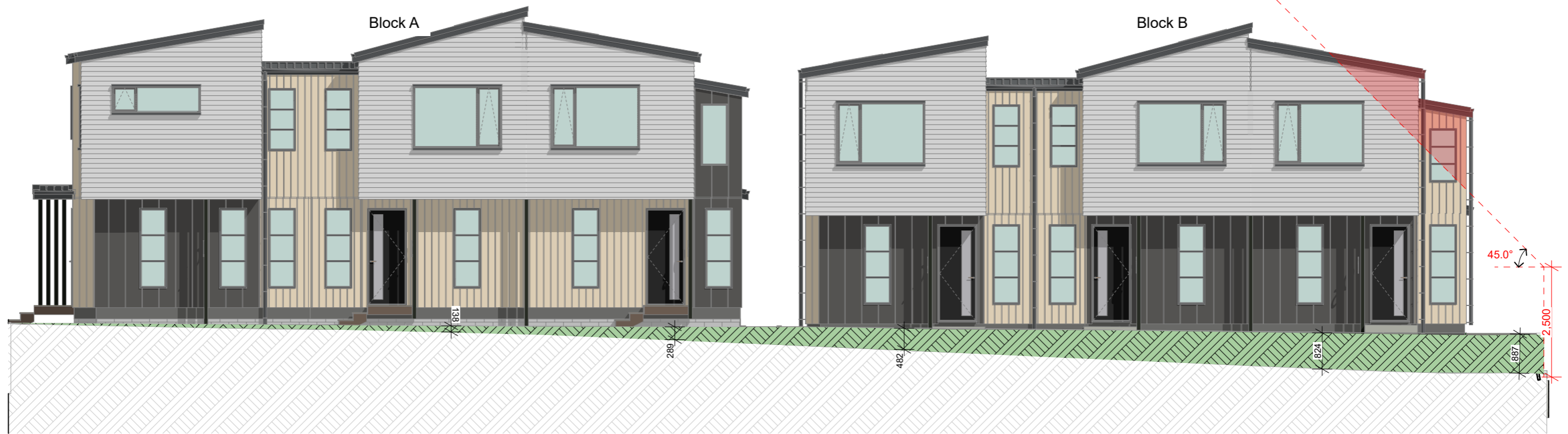
5 South Elevation Block A & B 1:100