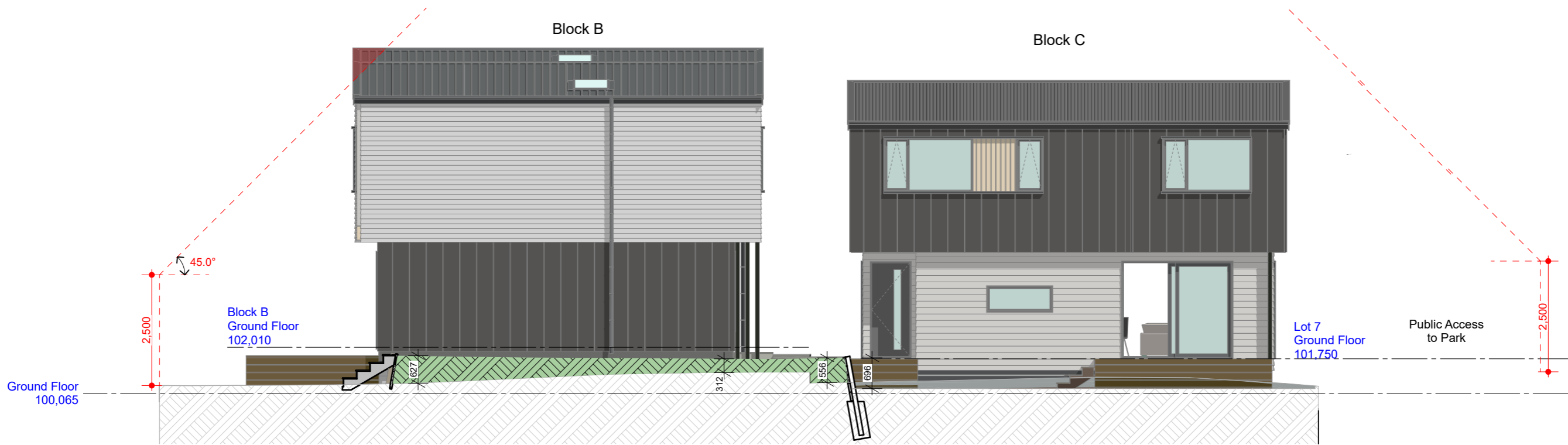
2 West Elevation Block B & C 1:100